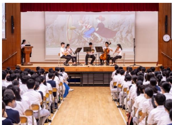
Community Outreach Performance at Tin Ka Ping Secondary School