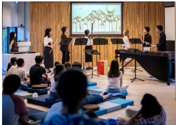
Quarryside Chamber Music Series: Young Pro Platform – Towards A Sea Change

Venue Partner: Quarry Bay Harbourfront Community Space 'Quarryside'