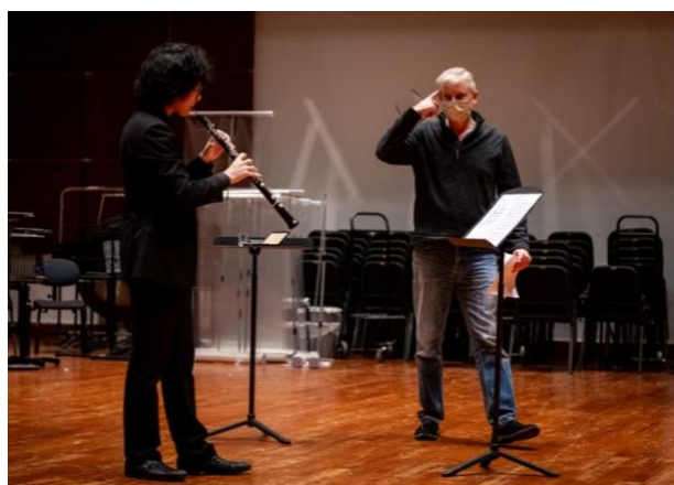
Mock Audition Workshop on Woodwind, Brass and Percussion