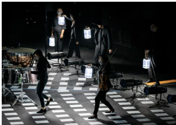
Young Pro Platform - Towards A Sea Change: Mission Possible Performance at The Box, Freespace

Co-presented by: Freespace, West Kowloon Cultural District