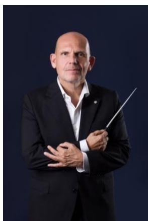
Jaap van Zweden Music Director of the Hong Kong Philharmonic Orchestra